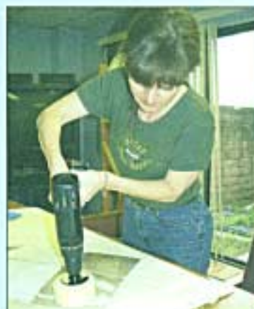
Windshield fix-it products...page 10

16 GARMIN GMA347 An audio panel rich in features but complex to use