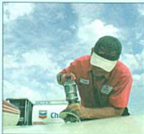
Why avgas won't die...page 20

After all these years, still the world's top utility aircraft... Page 24