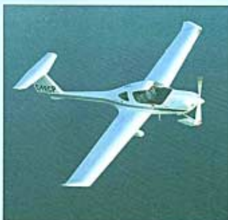
Three-way trainer flyoff...page 4

5 THREE TRAINERS Why Diamond's Katana is still the one to beat